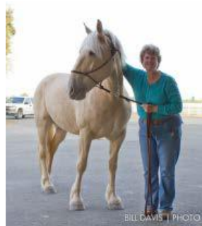
left: Belle and Bobbi below: Belle and Lucky