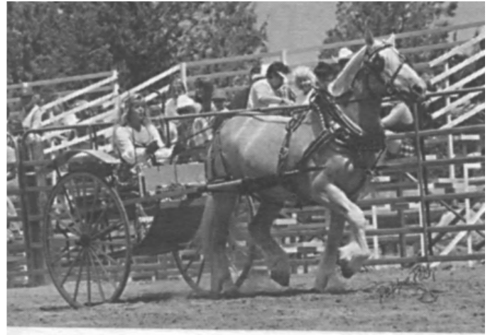
Captain's Barnabus Gold. Eagle Crest Draft Horse Show 1999 - Ladies Cart Class. Author driving.

There has always been a bond throughout time between mankind and the horse that transcends common explanation. There has also been that part of us that is fiercely proud of what we produce, or own, especially when that object is set apart and uncommonly unique.