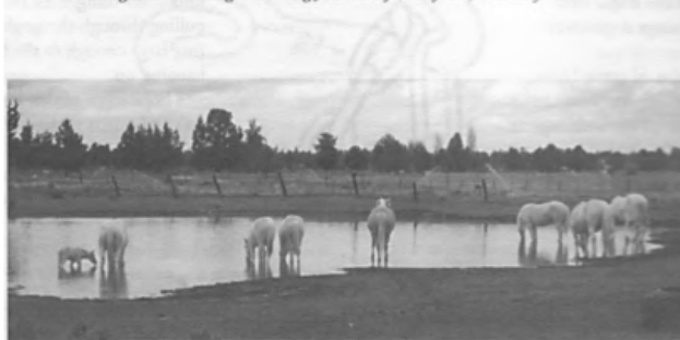
Cream acres Ranch at the lake. (center horse Cream Morgan cross).

and independent West Coast draft shows with the Oregon State Fair leading the way about 9 years ago. The Creams came and would not go away. The crowds love America's golden horse. They love the underdogs, as the Cream has sometimes been, amidst the well known and more common draft breeds.