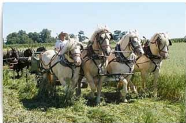
Getting it done

Comments we heard, "I have heard of the Creams but had never seen any"; "They are a lot bigger than I expected"; "The color is beautiful". From one Amish man who was in disbelief that our horses could hold up doing field work as well as their horses, was soon corrected by an Amish friend of mine that they will. He had seen them work many times amongst their Amish teams.