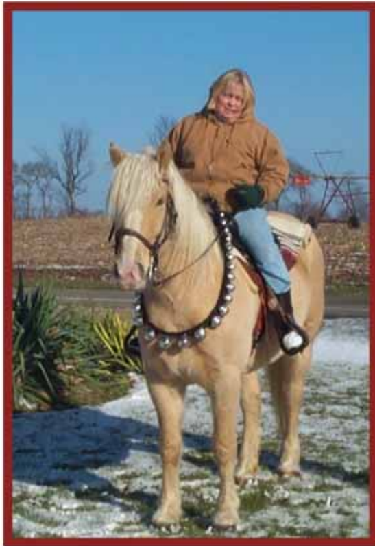
My first American Cream HnJ's Lady May #373

LATE WINTER-EARLY SPRING 2011 VOLUME 21 NO. 1