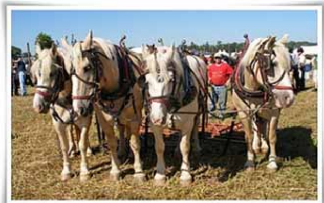
Ray's Golden Girl (Sissy), Timex, HnJ's ClarAnn, HnJ's Kitt

Horse Progress Days on July 1st, 2nd, and 3rd was a special day for me, the ACDHA and especially my working American Cream Draft Horses.