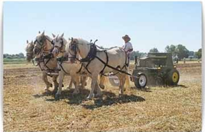
No Till Planter